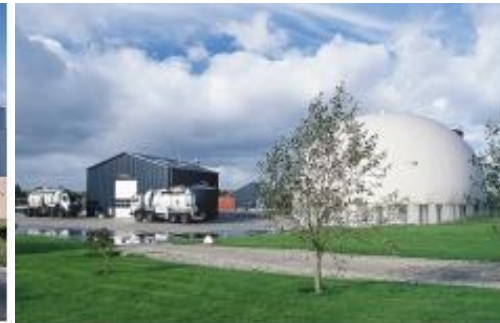
Thorso biogas plant, Denmark