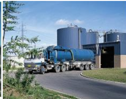
Ribe biogas plant, Denmark