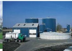
Studsgaard biogas plant, Denmark