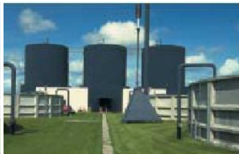
Large scale Danish biogas plant at Lemvig, noted as successful case study in IEA BioEnergy Report (2005)