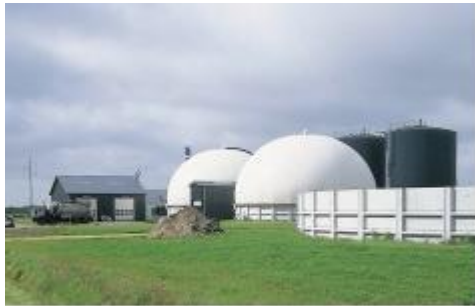
Blabjerg biogas plant, Denmark

Danish biogas plants meet strict odor control standards and have proven that the worst organic waste can be handled without serious odor problems. See Danish Environmental Protection Agency Study (2007). Polish public does not realize what is technically feasible.