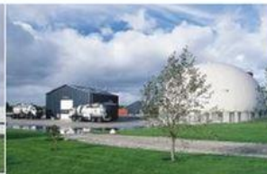
Therso biogas plant, Denmark