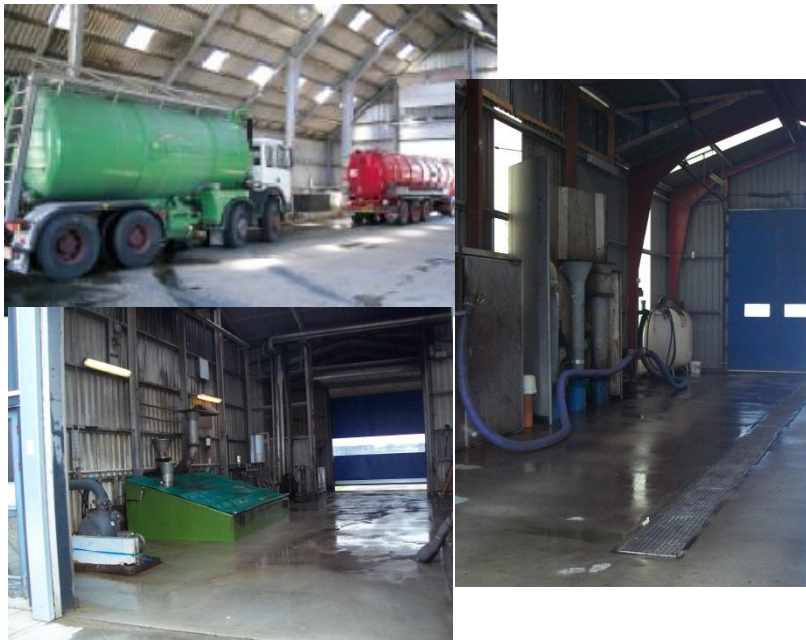
Direct feeding of solid biomass

Danish standard: Waste transferred in closed building with negative air pressure vented to odor filter. No open air exposures (left). Farm plant procedure (right).