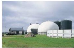
Blabjerg biogas plant, Denmark

Scarcity of Personnel: Hardly unique and easily cured.